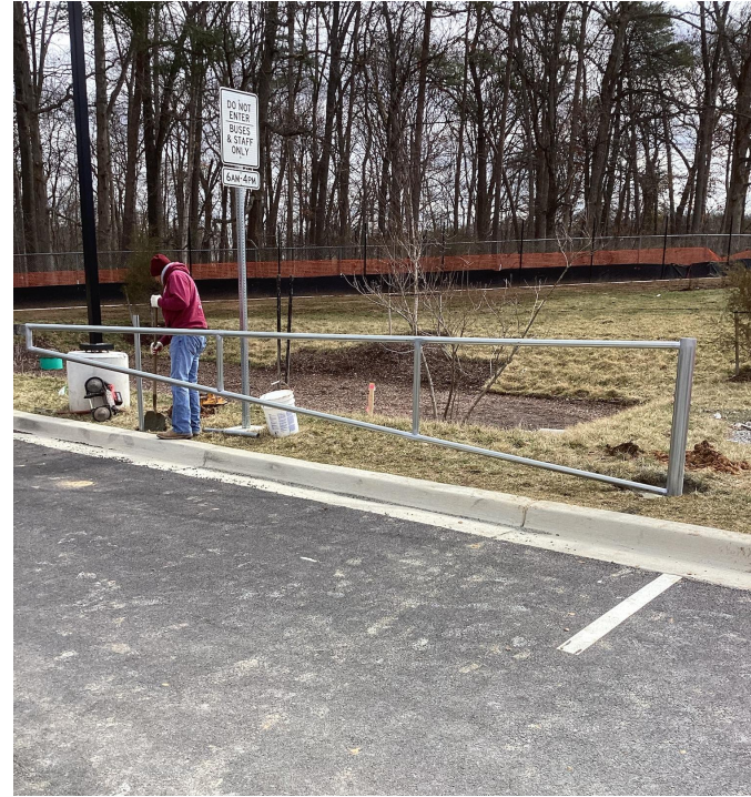
Roadway Gate Installation