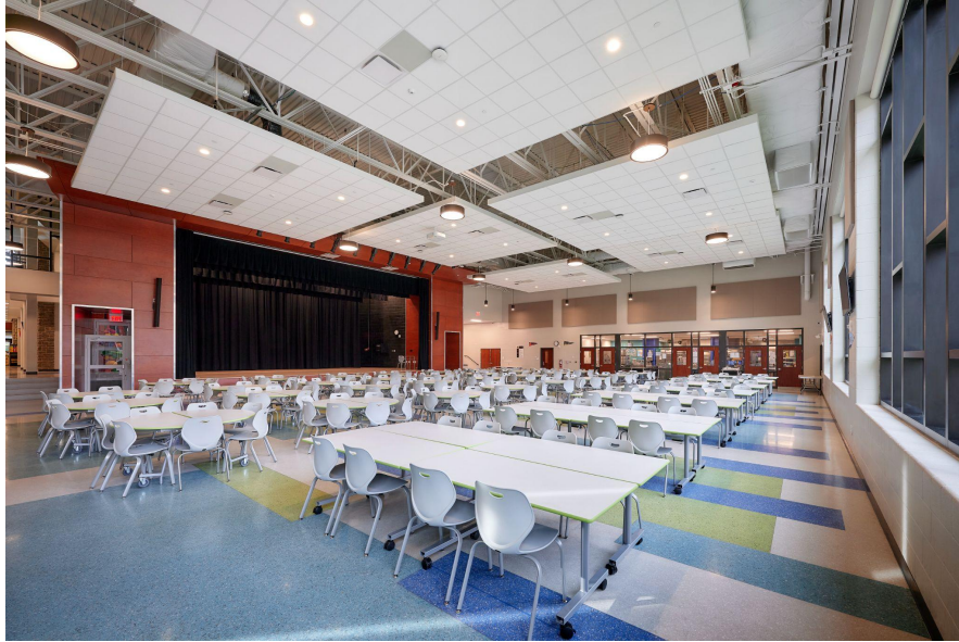
Cafeteria / Stage