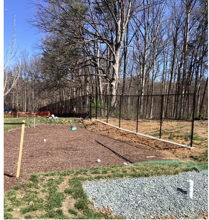
Field Perimeter Fencing