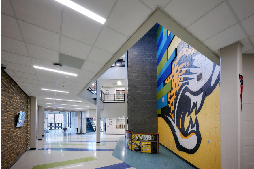
First Floor - Entry