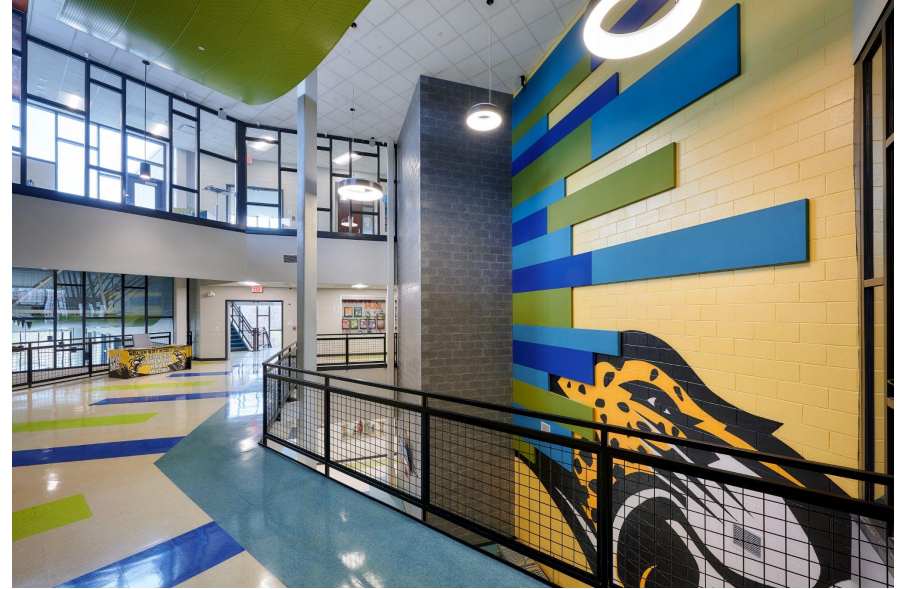
Second Floor - Entry