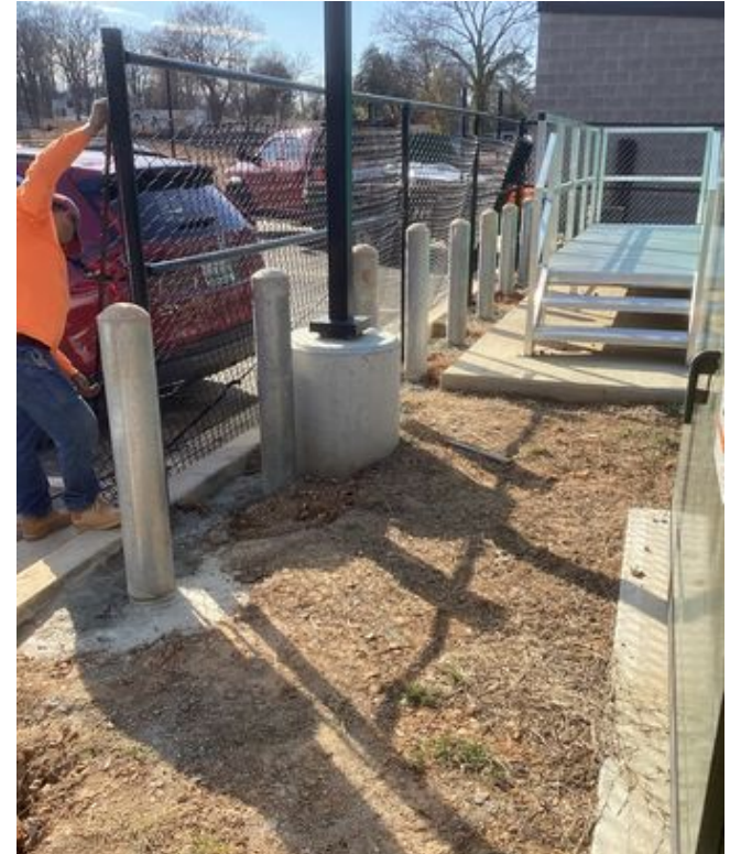
Installation of Bollards